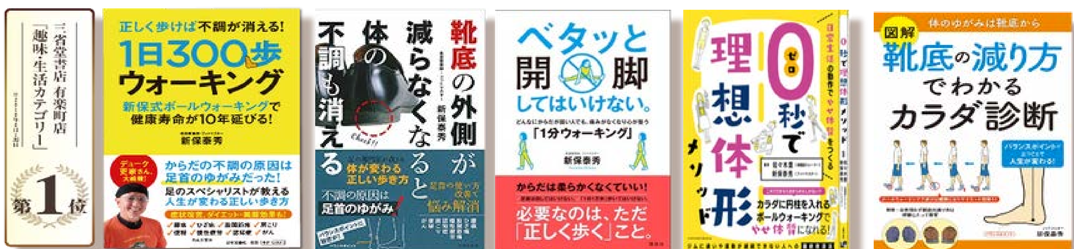
Books by SHINBO