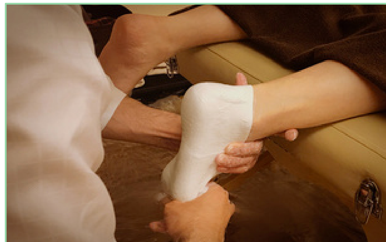
Made with a plaster mould