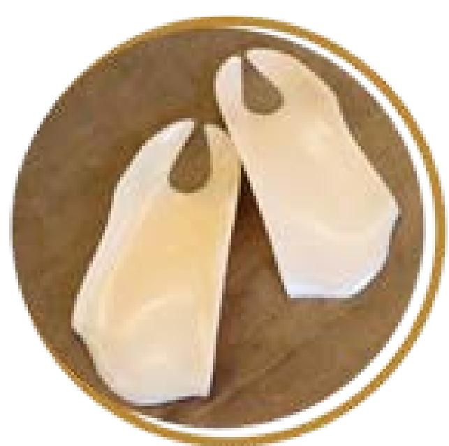
For high heels