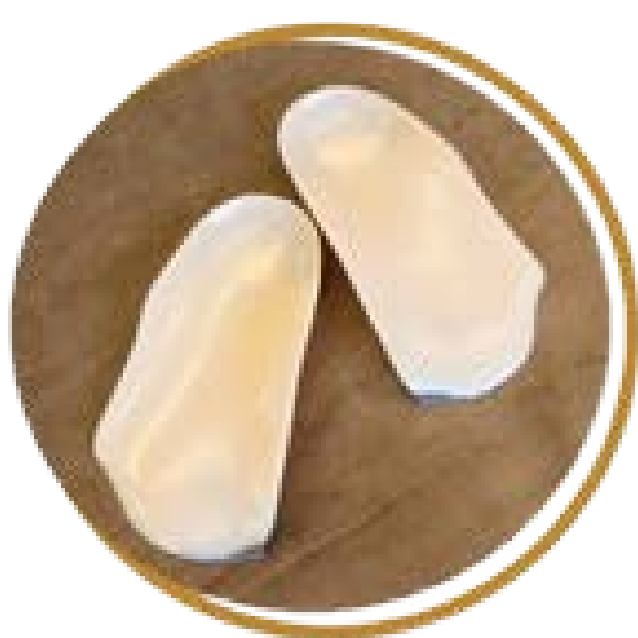
For trainers and flat shoes